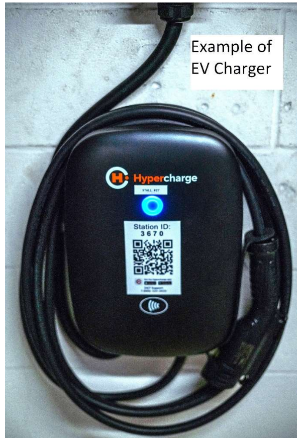
Example of EV Charger