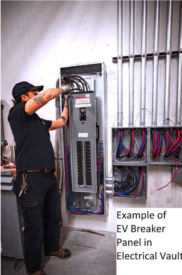
Example of EV Breaker Panel in Electrical Vault